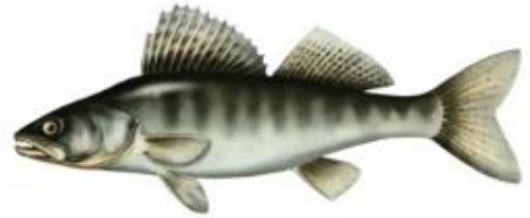
Sander lucioperca (łac) Zander (ang) Perche Brochet (fr) Sandacz (pl) Size 45 cm