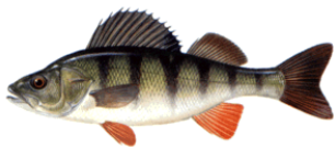
Perca fluviatilis (łac) Perch (ang) Perche (fr) Okoń (pl) Size 20 cm