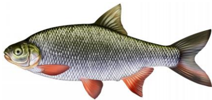
Leuciscus idus (łac) Ide (ang) Ide (fr) Jaź (pl) Size 25 cm