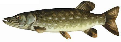
Esox lucius (łac) Pike (ang) Brochet (fr) Szczipak (pl) Size 45 cm