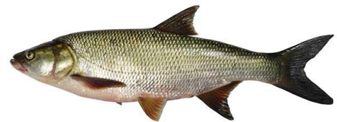
Leuciscus aspius (łac) Asp (ang) Aspic (fr) Boleń (pl) Size 40 cm